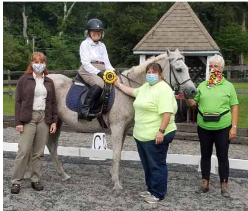
Virginia Streamer: 80 | Atlantis: 25 | Combined: 105

When I heard about the Icelandic ponies and saw the tölt on YouTube, I decided that